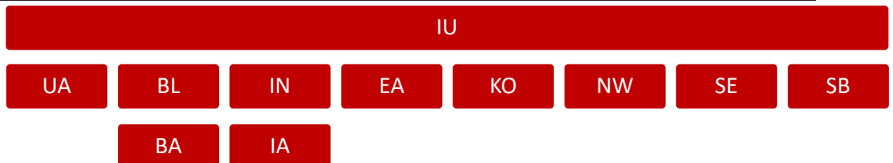
CHART CODE VISUALIZATION